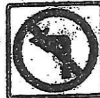
NO LEFT TURN