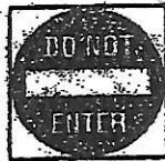
DO NOT ENTER