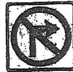
NO RIGHT TURN