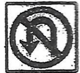
NO U TURN