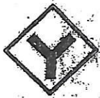
Y INTERSEC- TION