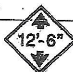
LOW VERTICAL CLEARANCE