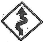
WINDING ROAD (LEFT)