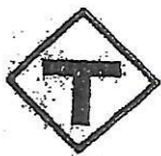
T INTERSEC- TION