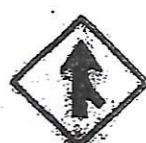
MERGING TRAFFIC (FROM RIGHT)