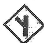
SIDE ROAD (LEFT ANGLE)