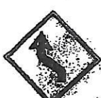
LEFT REVERSE CURVE