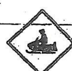
SNOW MOBILE CROSSING