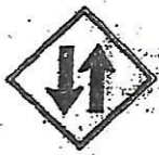
TWO WAY TRAFFIC