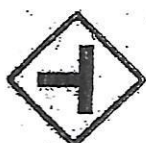
SIDE ROAD (LEFT)