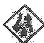
DIVIDED HIGHWAY ENDS