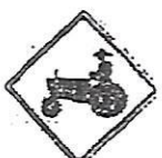
FARM MACHINERY CROSSING