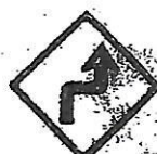
RIGHT REVERSE TURN