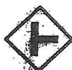
SIDE ROAD (RIGHT)