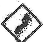
RIGHT REVERSE CURVE