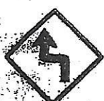
LEFT REVERSE TURN