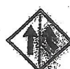
ADDED LANE (FROM RIGHT)