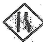
ROAD NARROWS (FROM RIGHT)