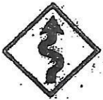
WINDING ROAD (RIGHT)