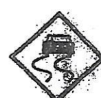
SLIPPERY WHEN WET